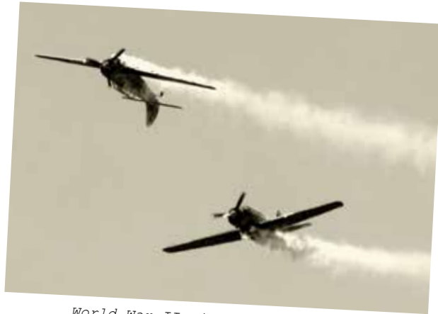
World War II airplanes in a dogfight

Crunchy Fritos smothered in homemade Texas chili, topped with pulled pork, shredded cheddar cheese and garnished with chopped onions ... 8